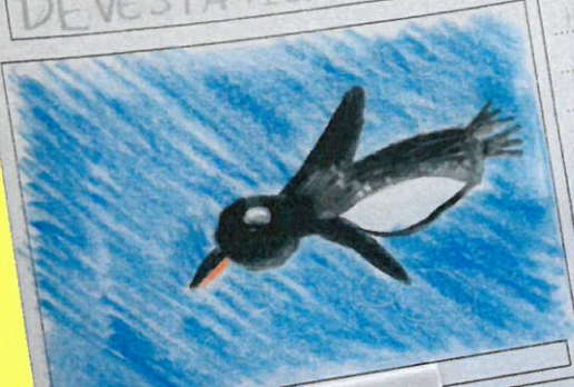
Penguins by Thea

Macquarie Island is a home to many animals and deserves to be saved! Macquarie Island is a home for a lot of nesting birds, seals and penguins. We need to keep Macquarie Island