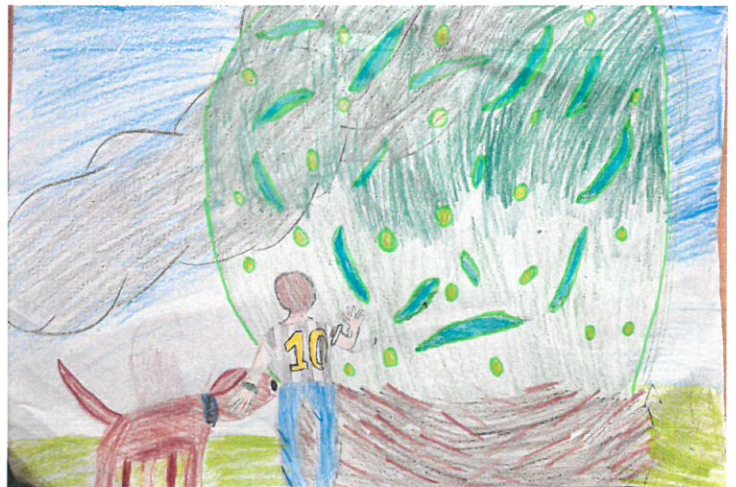
Illustrated by Jayda I.

"Mum, our house is ruined, it's been destroyed, we don't have a home to go back to....."